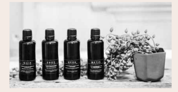
Beautyologist Essential Oil Blends, inspired by Greek Gods and Goddesses