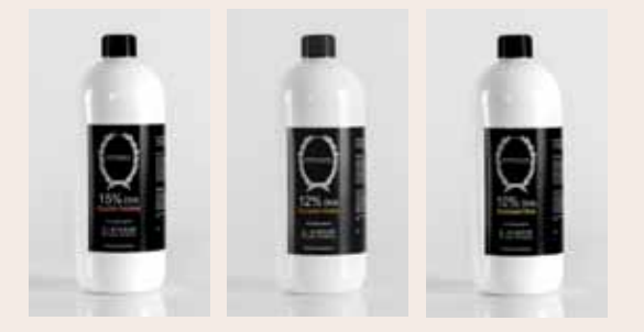
Our unique tanning formula contains Argan oil for deep hydration, resulting to longer wear